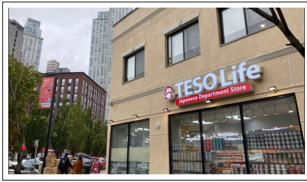
TESO Life in LIC