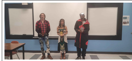
Halloween celebration (Fall 2024)

The Japan and Entertainment Club celebrated Halloween with a fun-filled event featuring a film screening of Ringu and a cosplay contest. Members gathered to watch Ringu , a classic Japanese horror film, enjoying the thrilling atmosphere. A creative cosplay contest allowed participants to showcase their best costumes, bringing beloved characters to life.