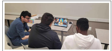
Video Game Day (Fall 2024)

In collaboration with the Tabletop Game Club, the Japan and Entertainment Club hosted Game Day, which transformed E-111 into a lively game battle arena filled with competitive spirit and camaraderie. The event featured popular games like Super Smash Bros. Ultimate, Dance Dance Revolution, and Mario Kart. The Game Day was a harmonious blend of fun and community engagement, leaving everyone eagerly awaiting future events.