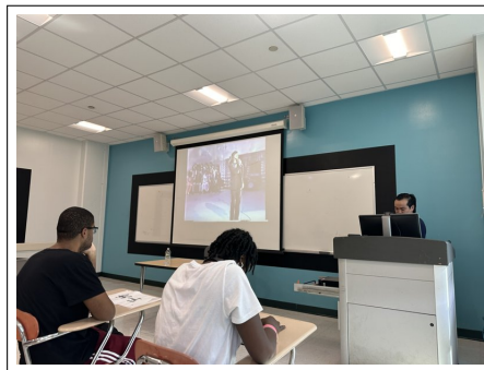
City Pop Lecture (Spring 2024)

A few club members in the Japan and Entertainment Club gave a lecture on City Pop. The presentation covered the nostalgic yet timeless genre of City Pop, a unique blend of J-Pop, jazz, and funk that emerged from Japan's vibrant 1980s music scene. Cultural impact and resurgence of City Pop highlight its influence on modern music.