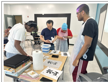
Calligraphy Workshop (Spring 2024)

as a meditative and expressive practice. The workshop featured hands-on learning and facilitated a deeper understanding of Japanese aesthetics among attendees.