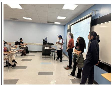
Japan Club Board Members (Fall 2024)

Thanks to the Fall 2024 board members for their dedication and creativity in making the Japan and Entertainment Club thrive in this semester. Your hard work and passion are truly appreciated.