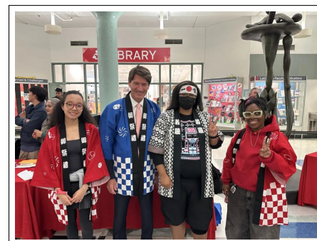
Fall Fest (Fall 2024)

The Japan and Entertainment Club participated in the Fall Fest 2024, a vibrant gathering held on Wednesday, September 25, 2024. This event, which took place in the E-atrium and Cobblestone area, featured representatives from over 30 student clubs, including the Japan Club. The Japan and Entertainment Club's booth captivated attendees with Japanese calligraphy, art-work, and origami demonstrations. Club leaders engaged with potential new members, introducing them to the club's upcoming events and fostering community spirit that is central to the club's mission.