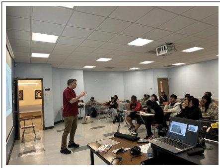
Temple University Transfer Workshop (Fall 2024)

The Temple University Japan Transfer Information Session offered detailed guidance for students interested in transferring to Temple University Japan in Tokyo. This informative event highlighted campus life, academic programs, application criteria, and financial aid options. It provided students with crucial insights into making a successful transition and offered networking opportunities with peers and faculty. The session was conducted in a hybrid format, accommodating participants both in person and online to ensure broad accessibility.