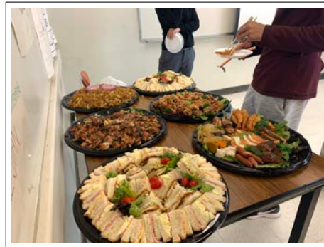
Japanese food and refreshments

Last but not the least, authentic Japanese food and refreshments were served during these club events.