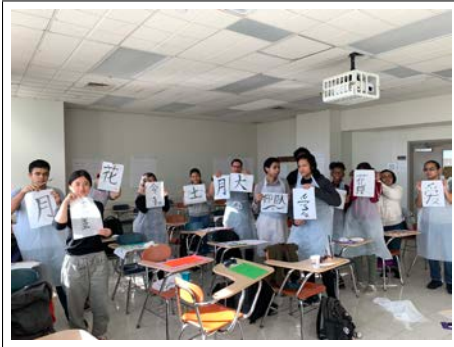
Japanese calligraphy workshop

members practiced Japanese calligraphy in absolute silence, following the rule "Calligraphy is a zen experience. Do not speak while practicing calligraphy."