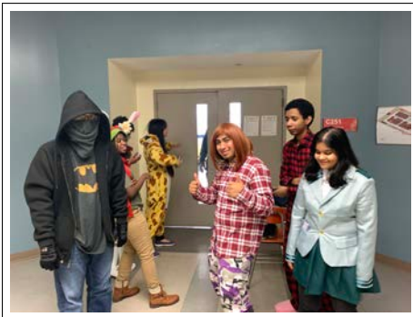
Japan Club Halloween Costume Contest 2019

On Halloween (Wednesday, October 30, 2019), the Japan Club hosted the Japan Club Halloween Costume Contest 2019. Club members participated in the costume competition, using their favorite cosplay costumes.