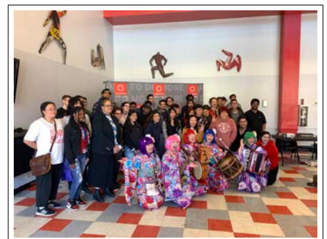
Bentenya Chindon Performance

The club also participated in the performance by Bentenya, Japanese Chindon performers, on Friday, October 4, 2019. Chindon-ya is an advertising business in Japan, known for their flamboyant costumes and catchy music. Chindon-ya was popular until the post-war period, but their tradition and appearance on streets are fading in modern Japan.