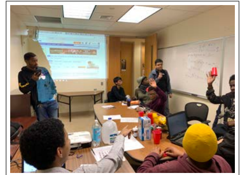
The first club meeting in Fall 2019

The club also participated in the performance by Bentenya, Japanese Chindon performers, on Friday, October 4, 2019. Chindon-ya is an advertising business in Japan, known for their flamboyant costumes and catchy music. Chindon-ya was popular until the post-war period, but their tradition and appearance on streets are fading in modern Japan.