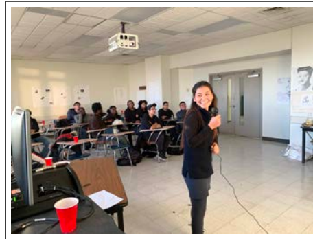
Japan Club's Karaoke Day

took place on Wednesday, November 13, 2019.