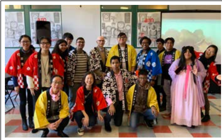
Fall 2019 Japan Club Board Members

The Fall 2019 Japan Club's board members played an indispensable role in another successful semester for the Japan Club in Fall 2019. Thanks to all of the Fall 2019 Japan Club board members: